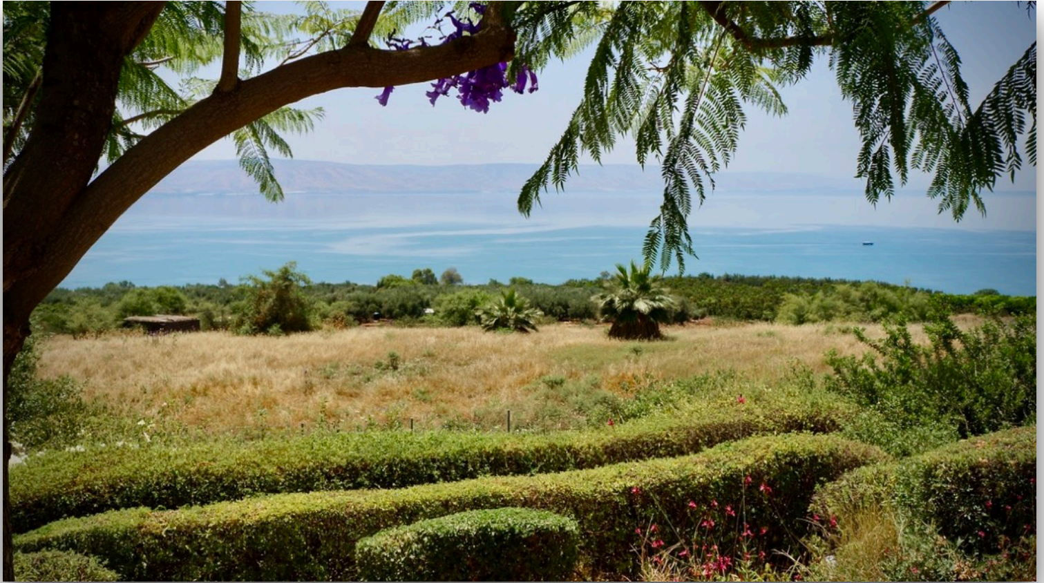
View from the Mt. of The Beatitudes overlooking the Sea Of Galilee to the Golan Heights