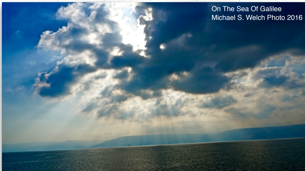
On The Sea Of Galilee