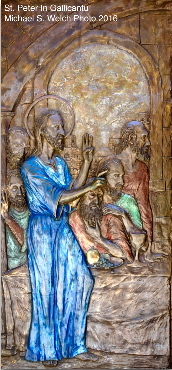
St. Peter In Gallicantu

Our lives are filled with much more serious events than this one that cause anxiety, but they all add up and we feel like we are suffering from something we cannot quite describe. When we are anxious, our demeanor suffers and our relationships with others suffer which adds to our anxiety. Also, and most importantly, our spiritual life is degraded and we lose sight of our true purpose. We find ourselves focused on ourselves and mundane issues of a material world trying to get everything around us to go the way we want it.